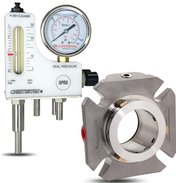
Flow Guardian SP50 with 1810 Single Cartridge Seal

The standard Flow Guardian flow meter can be fitted with a versatile, inductive proximity flow sensor designed to alarm the user when there is an interruption in water flush flow. It can also be used for high flow indication.